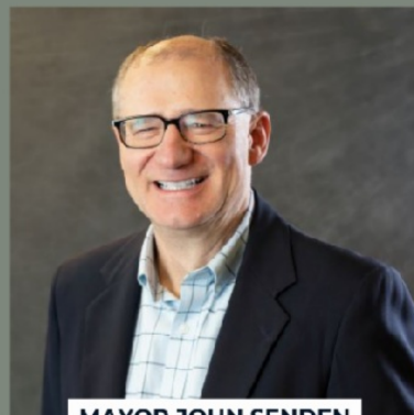
MAYOR JOHN SENDEN