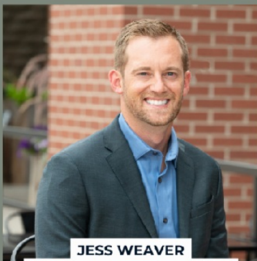
JESS WEAVER KETEL THORSTENSON, LLP