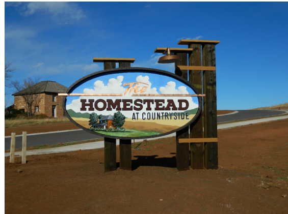
The Homestead at Countryside