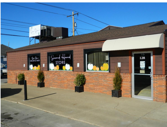
Dee Dee's Decor & More