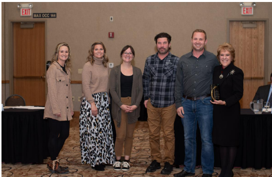
Spearfish Brewing Owners and Employees accept 2023 Spirit of Enterprise Award

The video discussed economic and building projects in the community including: Monument Health's announcement of a 37,000-square-foot healthcare clinic at Exit 17; Pacific Stainless Products opening a production facility in the Spearfish Business Park; and Pioneer Bank and Trust's new $10 million building, that's roughly three times the size of their current building and will open during the first half of 2023.