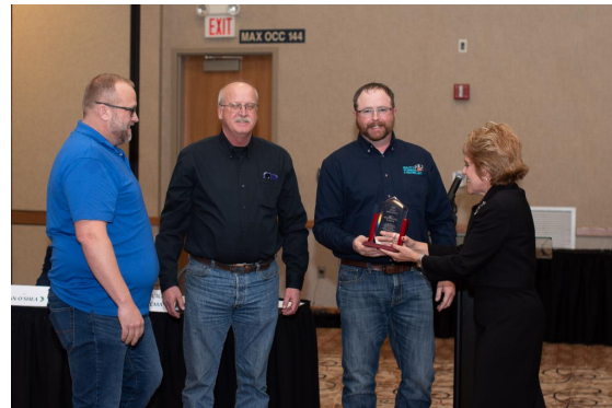
Wolff's Plumbing & Heating representatives accept 2023 Award of Excellence